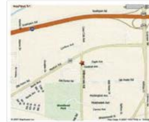
US Steel - Midwest Career Development 1919 Willowcreek Road, Portage, Indiana www.usscarer.com/midwest

To find out what classes are available check out the websites listed below.