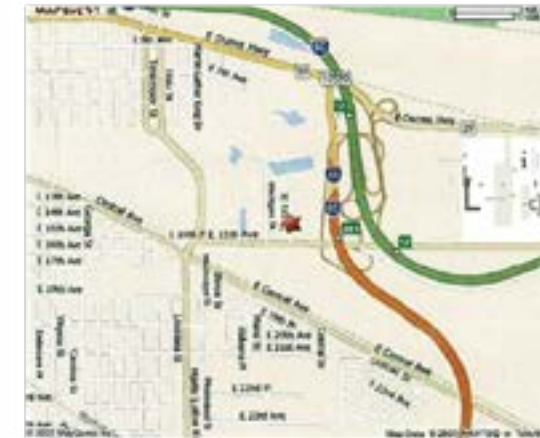
McBride Hall- Local Union 1014 1301 Texas Street, Gary, Indiana