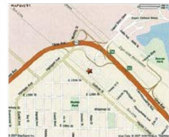
Bernard Kleiman Joblink Learning Center 3333 N Michigan, East Chicago, Indiana www.bkjoblink.org