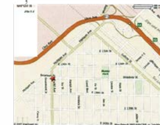
Leon Lynch Learning Center 1410 Broadway Ave., East Chicago, Indiana http://ihlearningcenter.org

Go to www.icdlearning.org . Find the catalog under resources.