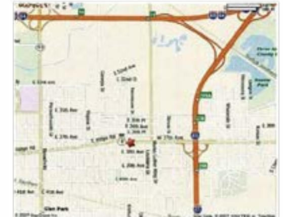
US Steel - Gary Works 1221 E. Ridge Road, Gary, Indiana www.usscarer.com